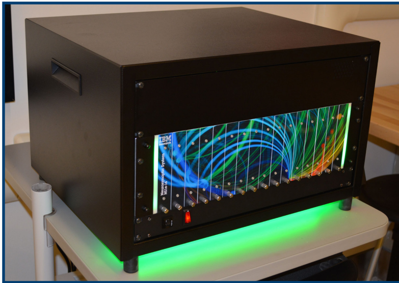
Figure 3: IBM 16 System TrueNorth Cluster