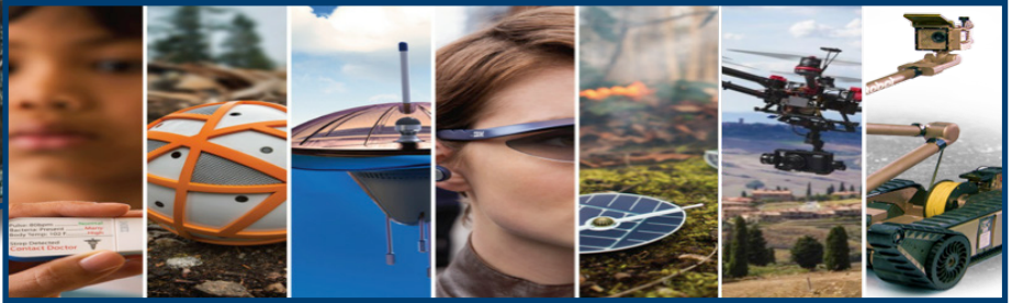
Figure 2: (below) The low-power real-time computing capabilities of neuromorphic computing will enable devices capable of intelligent data-driven behaviors in power-constrained environments.