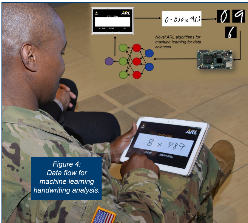
Figure 4: Data flow for machine learning handwriting analysis.

We continue collaborating with Lawrence Livermore National Laboratory to benefit from their advancements in deploying neural networks on neuromorphic hardware. We are beginning work with the University of Tennessee-Knoxville and Oak Ridge National Laboratory in exploring a simpler yet more flexible neuron structure, and in using evolutionary algorithms for programming the systems. We are collaborating with researchers from Purdue University to utilize neuromorphic computing with mobile sensors to discover different agents within an environment. We are seeking collaborations to apply our expertise and systems to intelligent sensors that reduce power and bandwidth requirements by utilizing neuromorphic computing to perform intelligent real-time processing directly at the sensor. We are also interested in applications to adaptive autonomous systems that receive and integrate information from a distributed array of deployed intelligent sensors. We are exploring ways to create a more flexible framework to expand the number of applications.